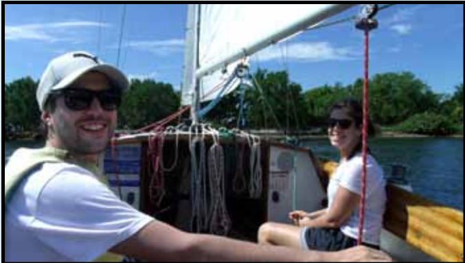
Another Great Day on the Bay