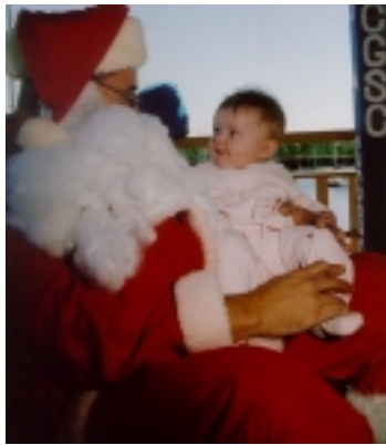
Santa arrives with a billowing Spinnaker and a Flying White Beard on Finesse .