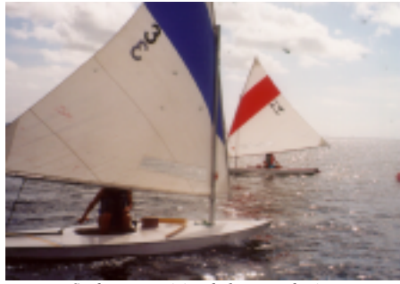
Students practicing balance and trim.