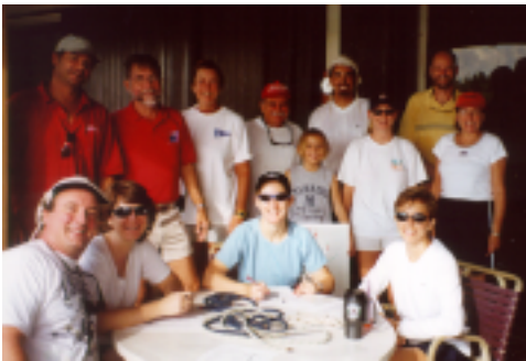
Students, instructors and member coaches meet to plan their day on the water.