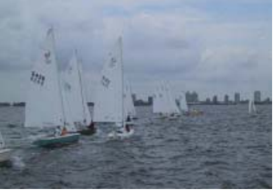
The Flying Scots position themselves along the line for the start.