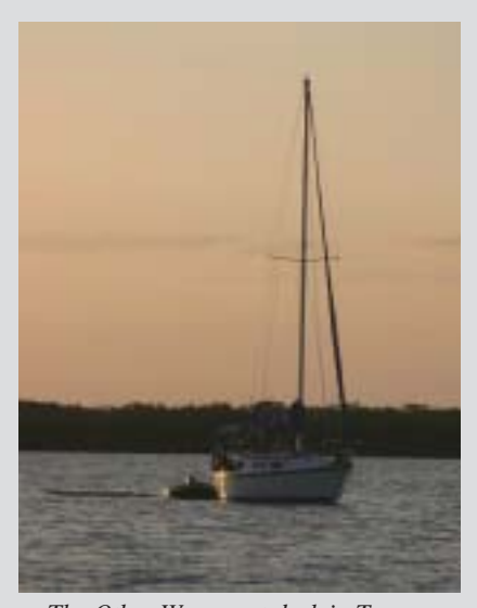
<u>The Other Woman</u> at dusk in Tarpon Basin during Spring Break.

Jose and Beth hope to one day, when the kids grow up, do some extended cruising together on their sailboat. For now, they are enjoying short vacations on the "Other Woman" with the entire family, weekend youth practice at CGSC and traveling to Optimist and Laser regattas with the wonderful families they have met through the CGSC youth program.