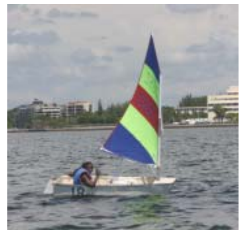
Above, one of the students from Verrick pool enjoys her day on the water after swimming and sailing classes.