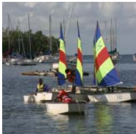
Left, students are paddling their boats to the dock for rigging.