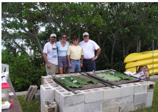
The Ramon's and Hamm's are shown at the pit build for the pig roast at CGSC.