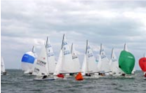
Left, A very crowded mark rounding for the few lasers who are mixed in with the lightning fleet.