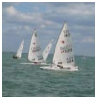
Above, Youth sailors tack up wind during a race.