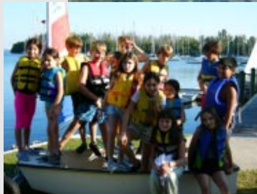
This is St. Stephens After school program, new session.