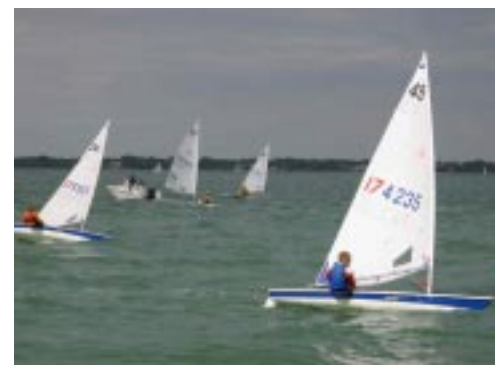
Racers work at tacking upwind and keeping their boats flat and on a plane downwind in one of the many races.