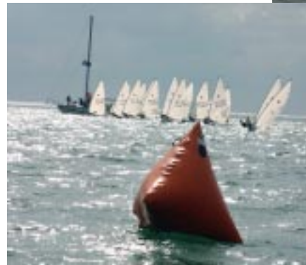
Left, unlike the Youth Lasers, the Adult Lasers started without general recalls or black flags. There were a few individuals recalls.