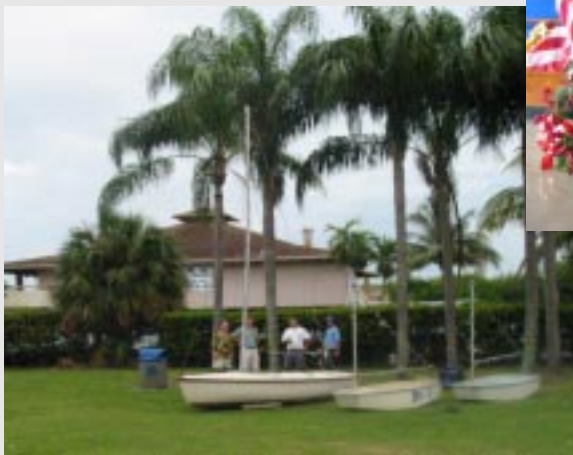
Christmas lights on the lawn.