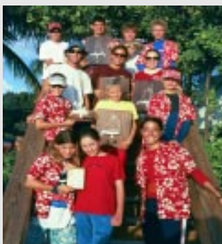
At right, CGSC Sailors and their trophies.