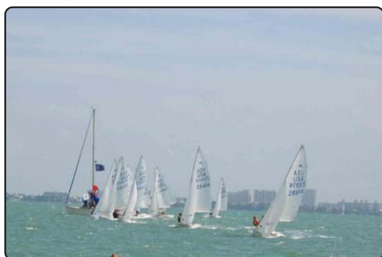
Left, A start of race. Winds caused some boats to withdraw.