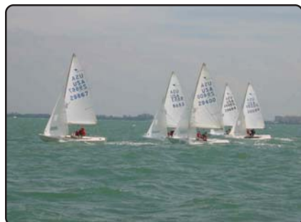
Boats race toward the windward mark.