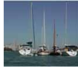
Marine Stadium Rendezvous

boats. This has been the highlight of our dockside rendezvous' – all the boats were Unbelievably Beautiful! Thanks to all who brought their boats to the docks!