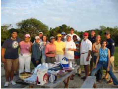
Elliot Key Thanksgiving