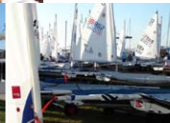
Laser Fleet on the grass at Coral Reef for the Orange Bowl Regatta.