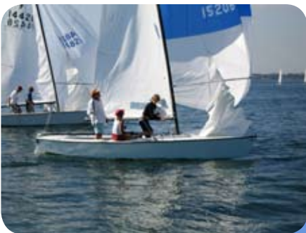
Lightnings go downwind.