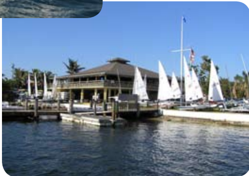
Back at the Club