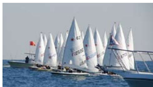
LYC Boomerang Regatta Laser start