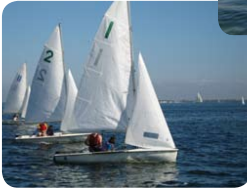
420s go upwind in light air