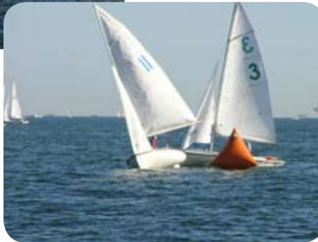
420's round the mark.

The forecast for Friday was not encouraging, with a light north breeze expected to switch to the southeast in the afternoon. Since so many of the competitors were from the snowy north, the RC elected to send the fleet out regardless. After another wind delay, the southeasterly filled in, and the final race of the regatta was sailed in light air, with the breeze increasing as the race went along.