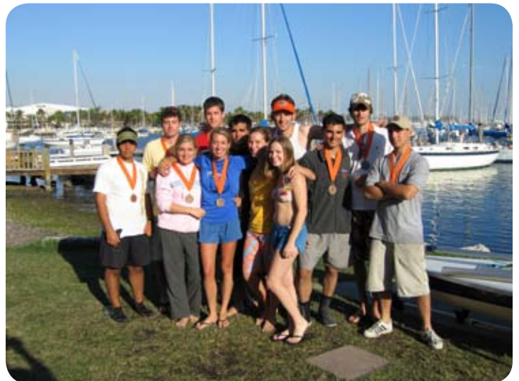
420 competitors from UF, U of South Alabama and Ransom Everglades