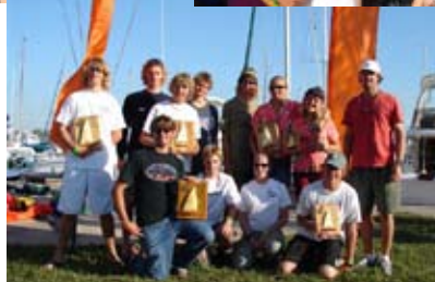
Some of the Laser Fleet that competed at the Orange Bowl Regatta.