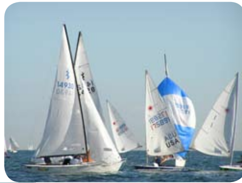
The fleets soon became mixed on the course.