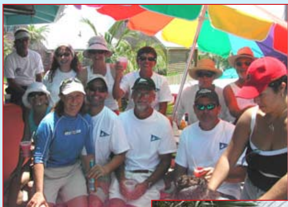
CGSC members gather for a group photo.