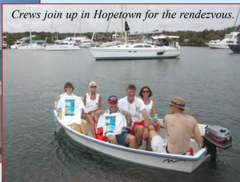
Crews join up in Hopetown for the rendezvous.