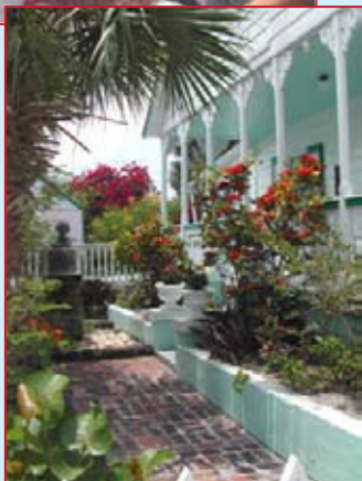
Above and above left are pictures of New Plymouth