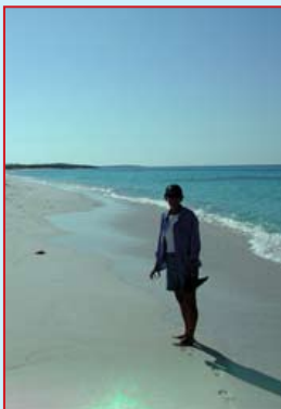
Walking on the beach in Guana.