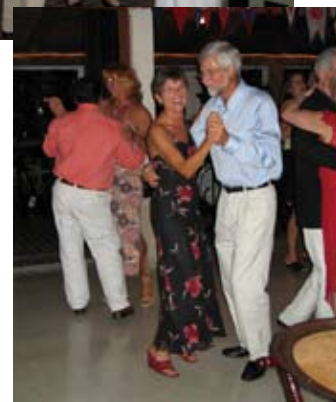
CGSC's 61st Installation Banquet