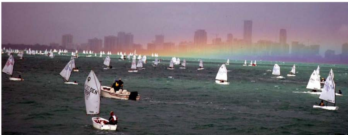
JUNIOR SAILORS FROM DENMARK, PUERTO RICO, CHILE AND THE USA COMPETING IN THE 2004 ORANGE BOWL REGATTA FROM COCONUT GROVE, VIEW THE MAJIC CITY OF MIAMI AT THE END OF THE RAINBOW