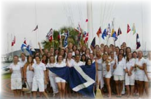
The entire Single Handed Fleet.