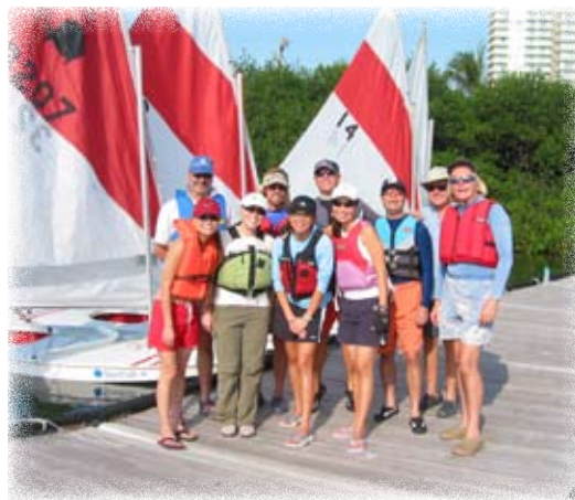
Learn-to-Sail class is all smiles before their first group sail on the Bay