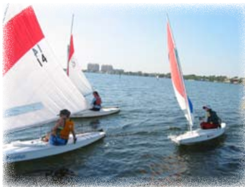
Ladies practicing at the start line during the weekly clinic.