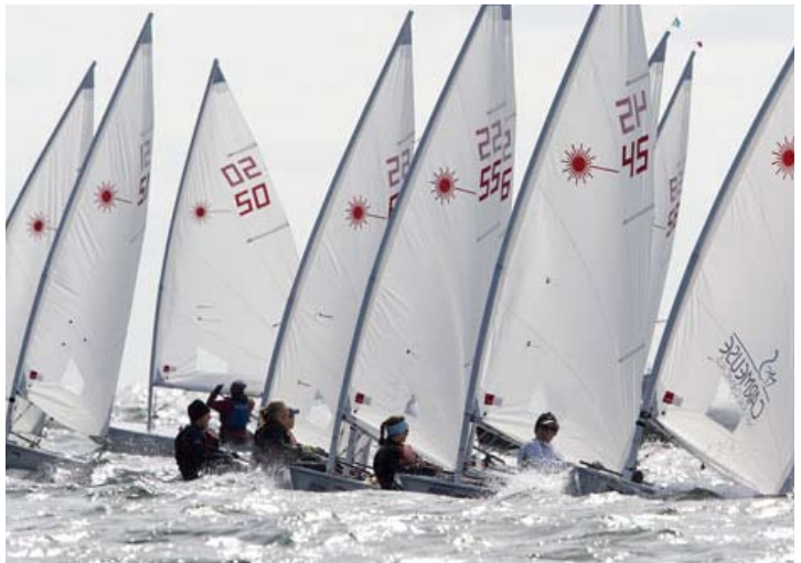
Competitors fight for position during a race.