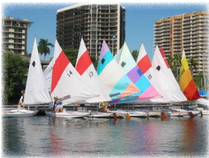
Nine Sunfish made ready for the UM students morning sailing session

Fair Winds and Safe Sailing, Adult Sailing Committee