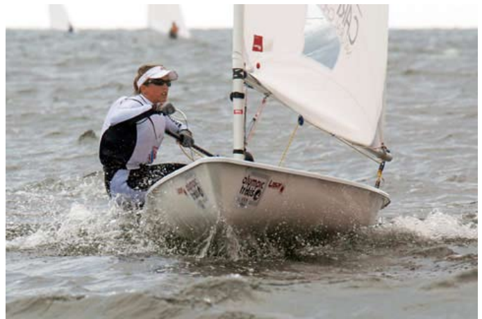
Anna Tunnicliffe shows why she was on top in Laser Radials.