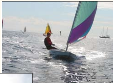
No Macho here.... just balance and finesse at work.