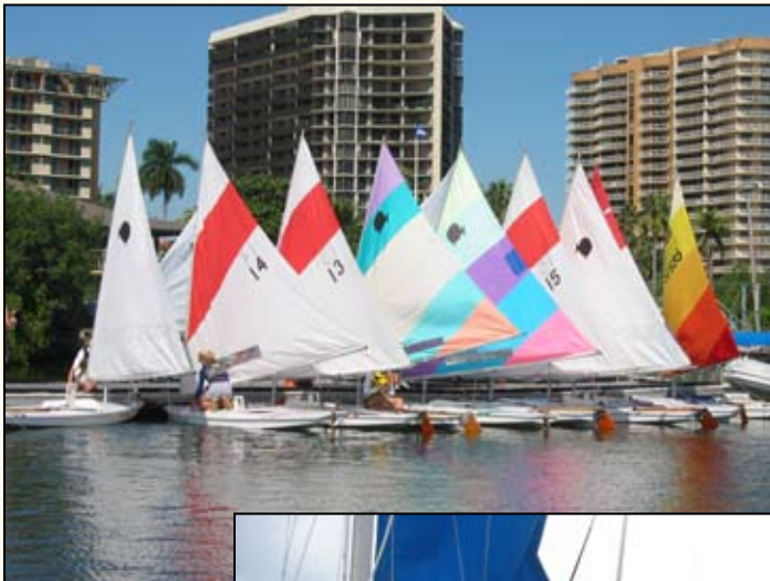
This is Great Turn-out for the Clinic