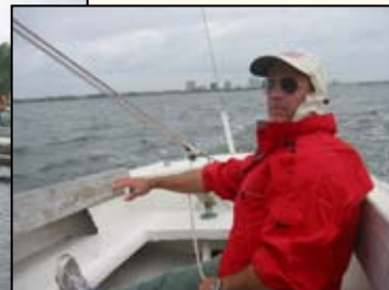
This student learned the value of being well-prepared for an extra cool, breezy class day.

Private or Group Keelboat Courses... Each sailor is taught and must be able to rig, reef (if necessary) and depart from a dock or mooring under sail only.