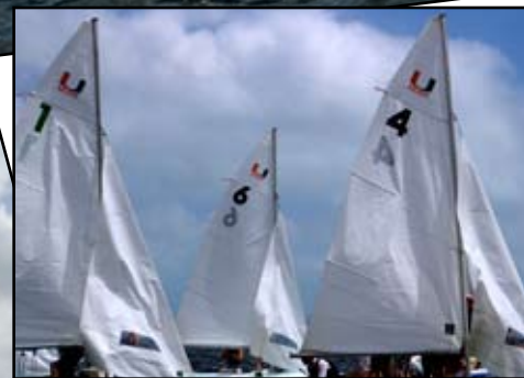
New sails, Ooh la la...