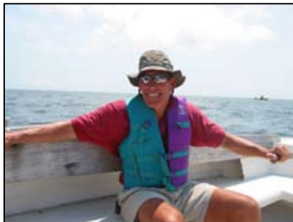
Pilots catch on quick.