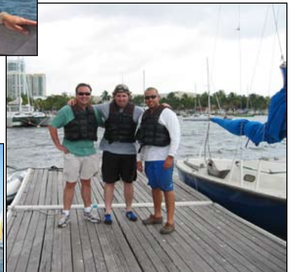
Wet but still smiling after a breezy keelboat day on the bay.