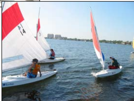
At the start line.