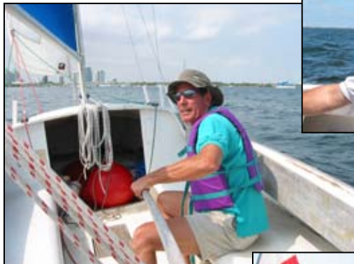
Single handing for certification.