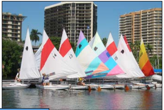
Sailing with the Stars.