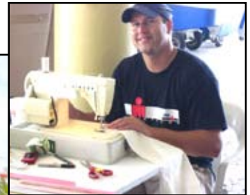
Assembling the island dog bar