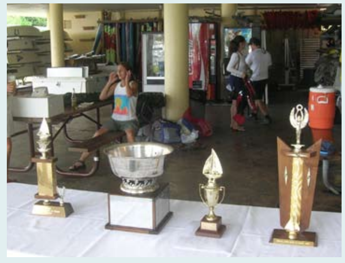
Florida Jr. Snipe Trophies