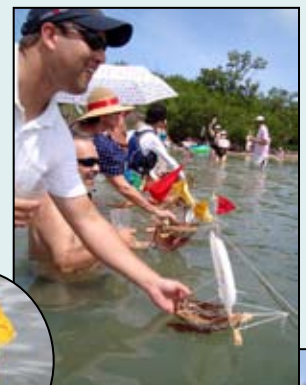
The big race begins.