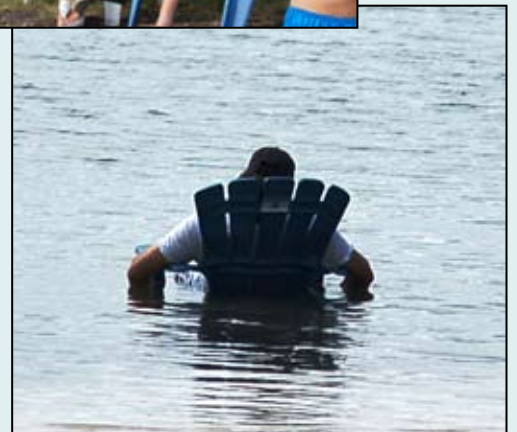
Just another day in paradise.