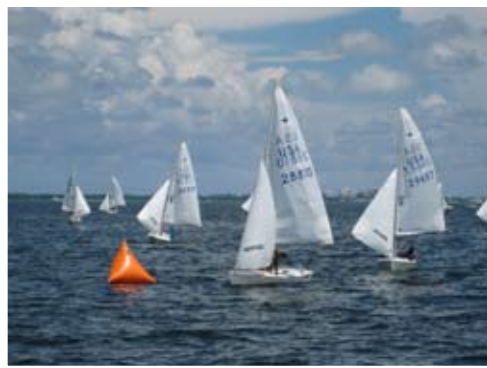
Left, the racers approach the gate.