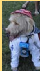
Barney the Dog