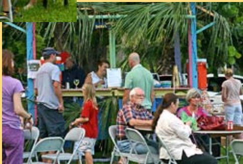
Island Dog Bar

Columbus Day Regatta Raftup – After the race join the CGSC fleet at the south end of Elliot for a Raftup and potluck. Racers and nonracers welcome.