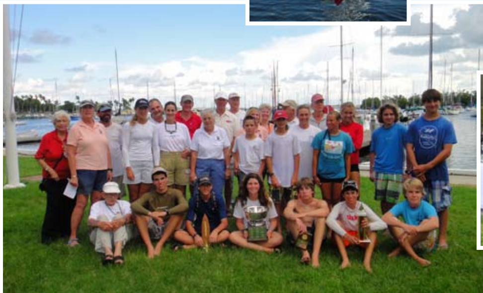
Competitors and race committee, after a fairly quiet day on the bay, pose for a group picture after Trophy Presentation Sunday.