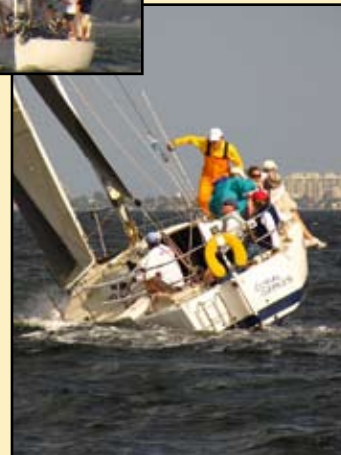
Hot Air getting up to weather.