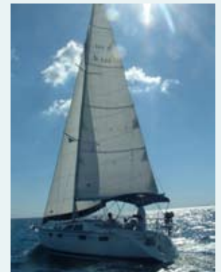
Cruising Class with Bernie Baetzel at the helm.