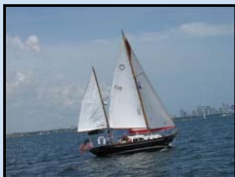
Effortless, Commodore Alyn Pruett

The CGSC couldn't be one of Miami's great racing clubs without these skippers volunteering their time and their boats on race weekends. If you have a moment, please say thanks the next time you see them.