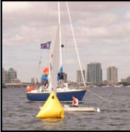
Ivory Gull