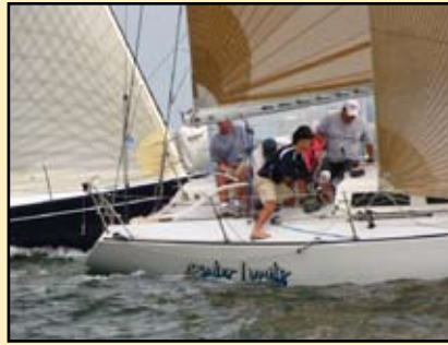
Outer Limits and Thin Ice at the start