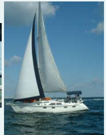
Leaping Groundhog close reaching in 15 knots of wind during a Bareboat