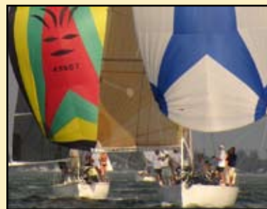
Outer Limits and Mainsqueeze under spinnakers.