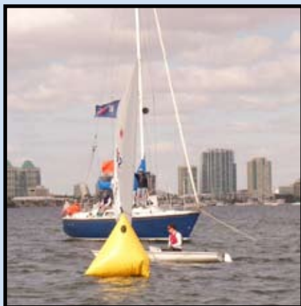
Ivory Gull