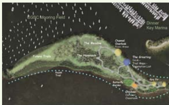
Island E Conceptual Plan