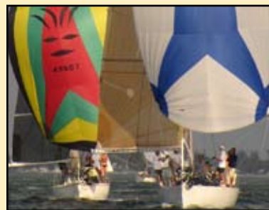
Outer Limits and Mainsqueeze under spinnakers.