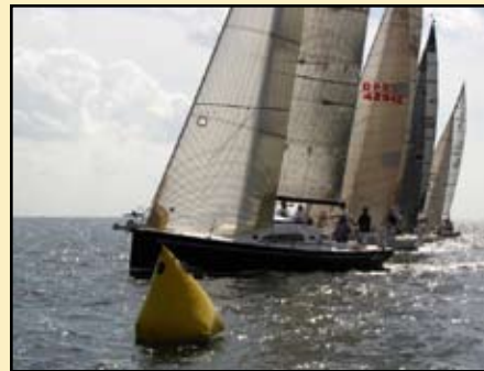
The placid start of race two.