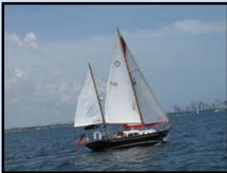
Effortless, Commodore Alyn Pruett

The CGSC couldn't be one of Miami's great racing clubs without these skippers volunteering their time and their boats on race weekends. If you have a moment, please say thanks the next time you see them.