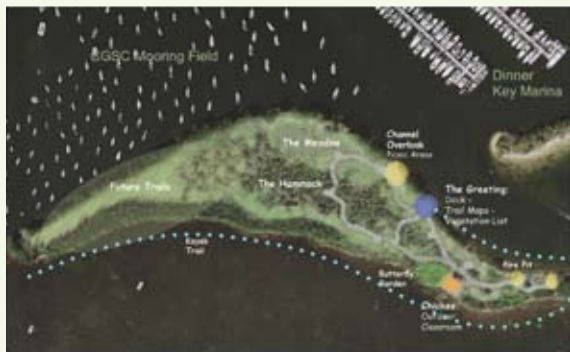
Island E Conceptual Plan