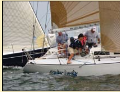
Outer Limits and Thin Ice at the start