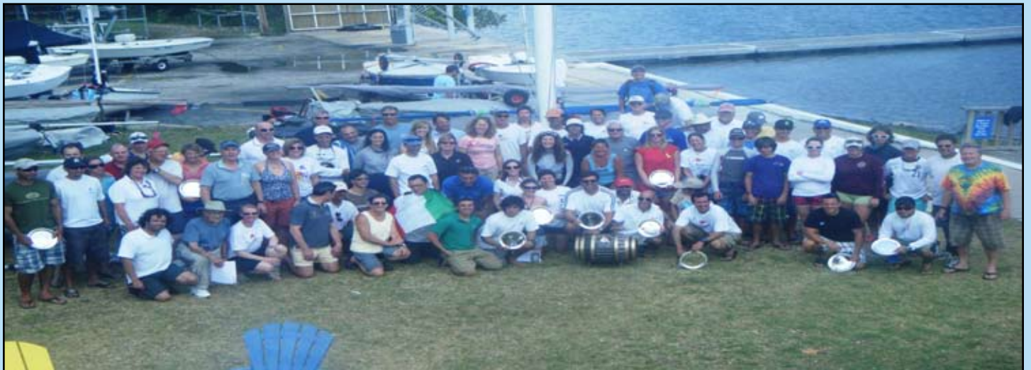
Don Q 2011 Group Picture