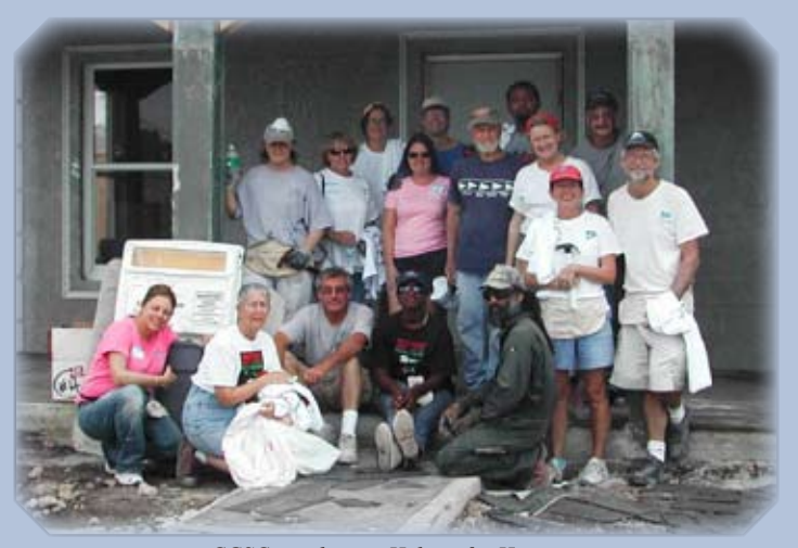
CGSC members at Habitat for Humanity.