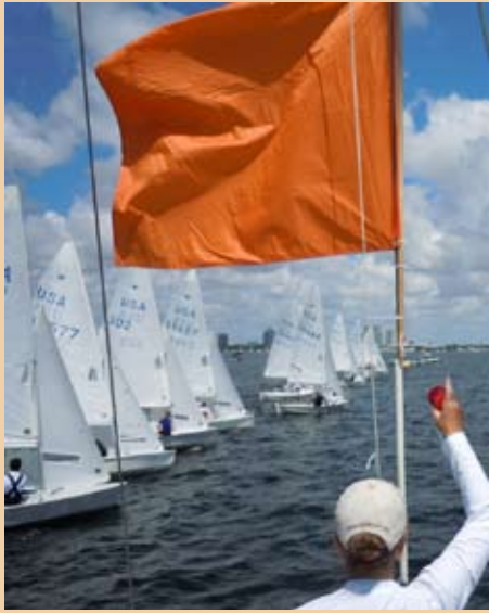
Racers approach the line in preparation of the next start.