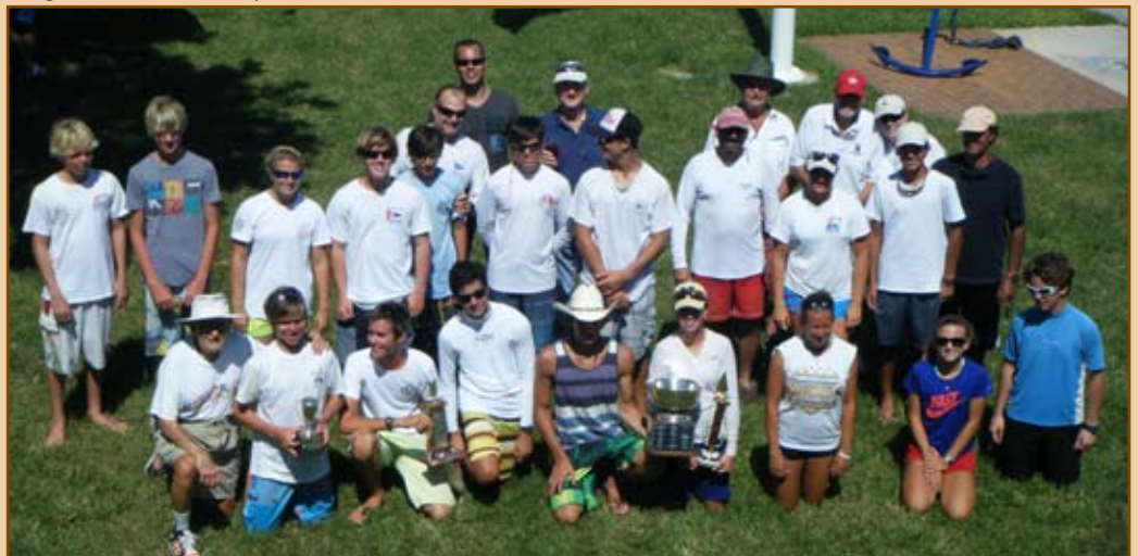
The silors pose for a group picture after trophy presentation.