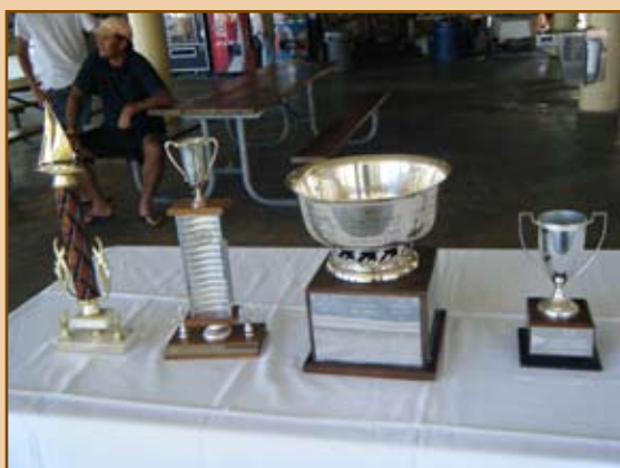
Trophies ready for awarding