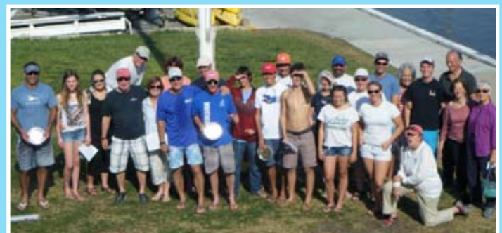
Group photo 2013 Comodoro Rasco Snipe Regatta