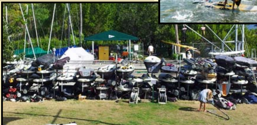
CGSC installed racks on the Strip and in the Myers Park area outside our North Gate to accommodate a record fleet of over 100 Olympic RS:X Windsurfers during the second half of January, 2015. The Club lawn remained quite open through both events.