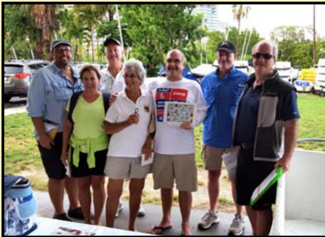
Participants gathered for the awards ceremony.