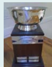
Commodore Cup Trophy