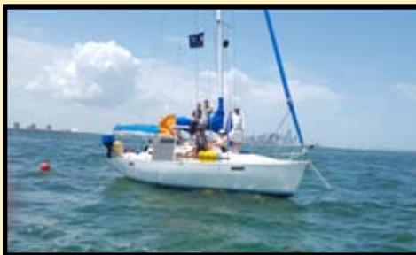
Race Committee enjoyed their day after the race was complete.