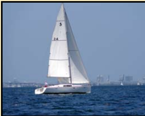
Sunquest with Wilfredo Parades