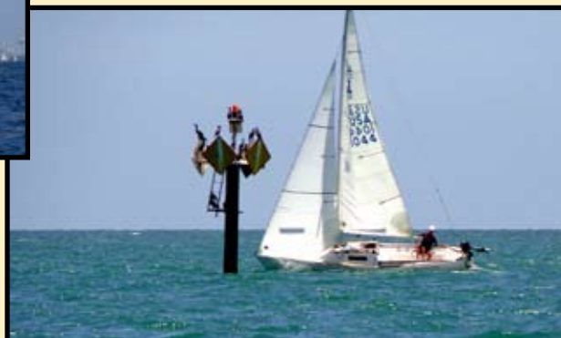
Loved Lion rounding the mark