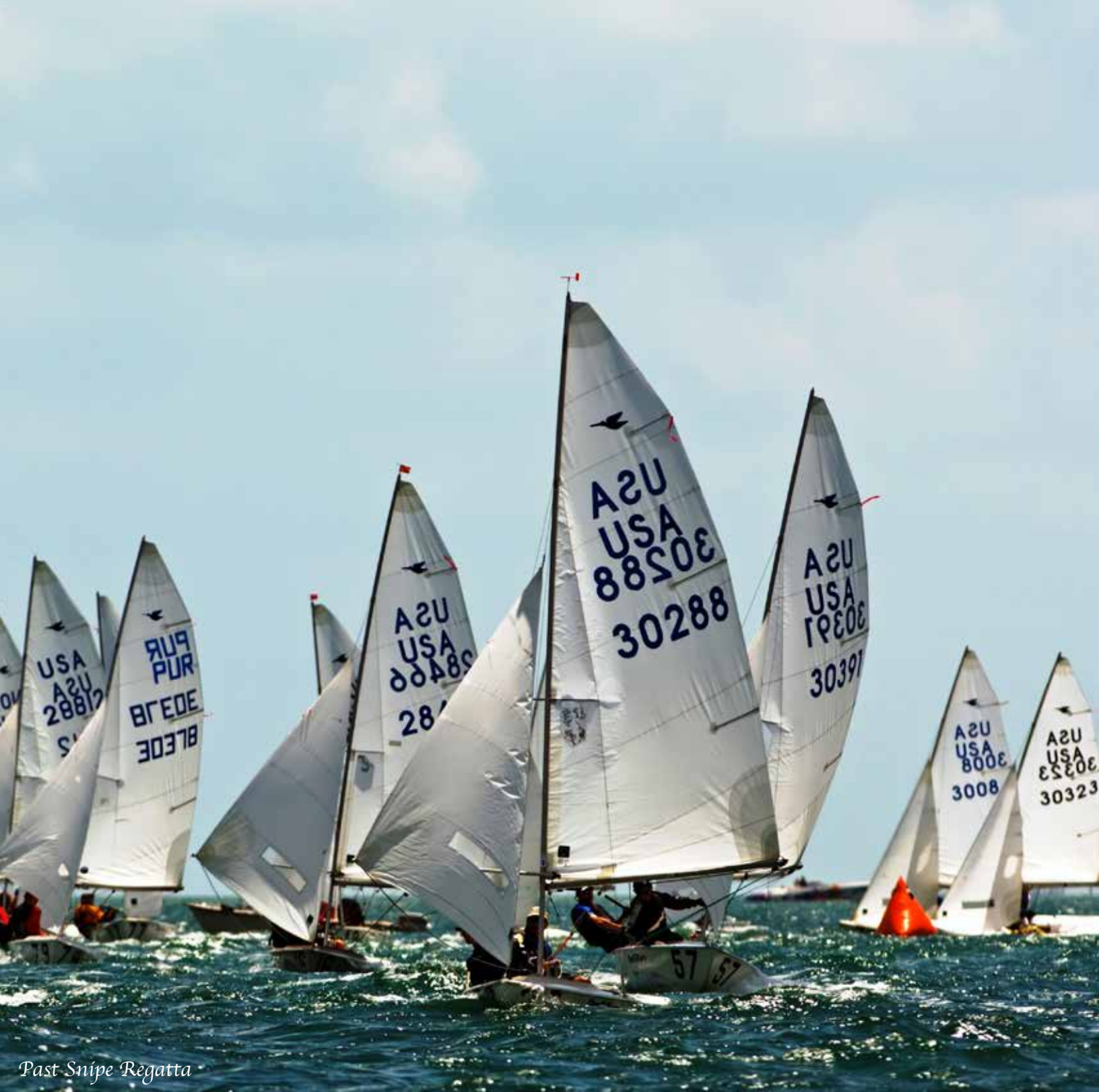
Past Snipe Regatta