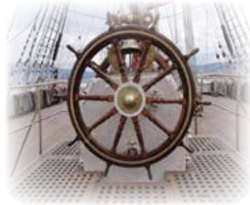
Example of ships wheel for a sidewheeled vessel such as the one pictured below.