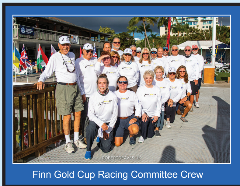
Finn Gold Cup Racing Committee Crew