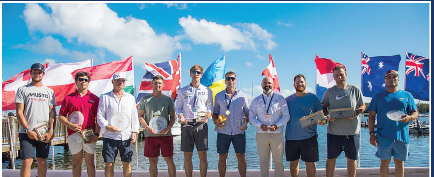
Gold Cup Winners