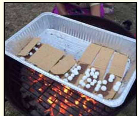
Getting creative to make s'mores when you have tiny marshmallows.