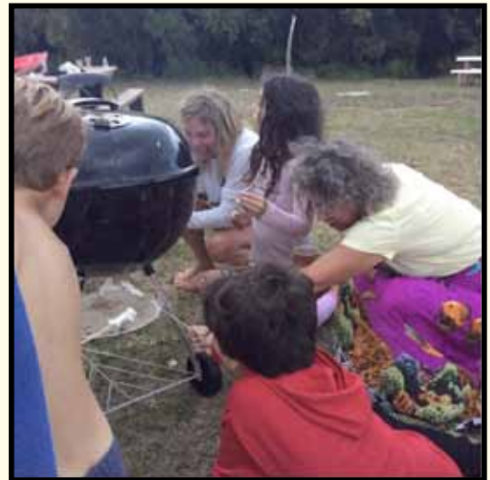
Trying to roast marshmallows.