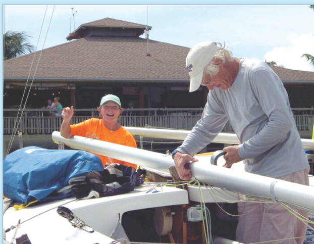
FS out of towners preparing for the Annual OD Regatta