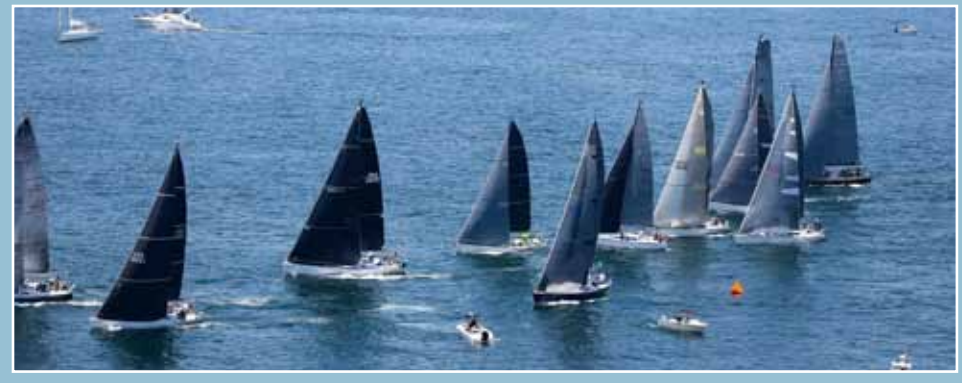
The race is on