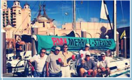
We have arrived

JULY 7 9:16pm - RC had an issue yesterday that affected their speed for a while. Issue appears to be resolved and they have been steadily gaining speed through out today and are doing their best to catch up. Let's all send them pleasant thoughts for good wind and increased speed. Not sure how close they were or if RC saw them but Comanche,