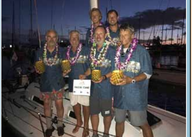
The crew enjoys the welcome at the dock after the finish.