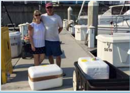
The ice chests carry the frozen foods

JULY 7 2:19pm - :00pm status update: see photo below for current tracker and here are clips from their daily communication for today. "RC is now 41 hours into the Transpac and doing OK. Typical early passage bugs and deficiencies are being overcome and conditions aboard are improving as we settle in, shake down, and sort out. It also helps that the wind is drawing aft. We set our first kite 30 minutes ago and, if your typist's (Joe) collected weather forecast data can be relied upon, we expect to be under spinnakers for the foreseeable future. The deck guys are busy flaking and stowing jibs so I can get away with being