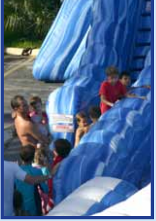
Waiting their turns