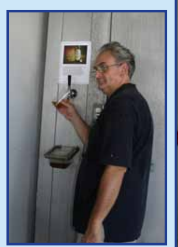
Dragon serves up beer on tap from the downstairs cooler.