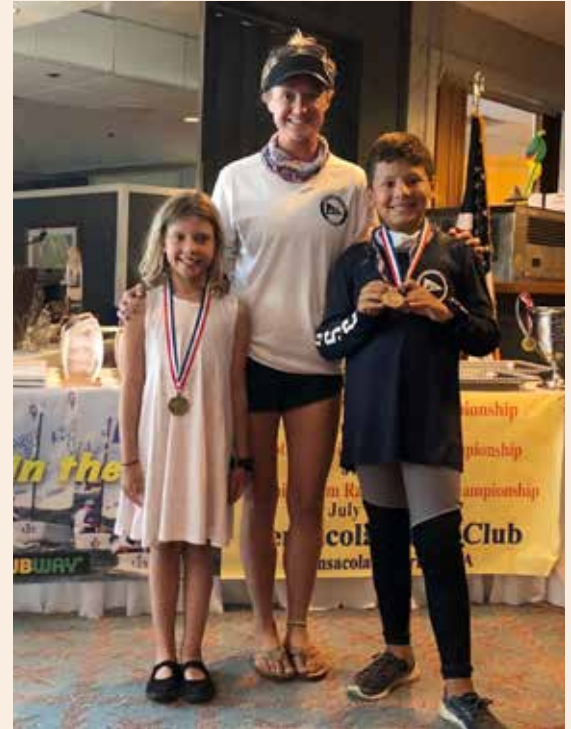
Green Fleet Sailors (23 total sailors)