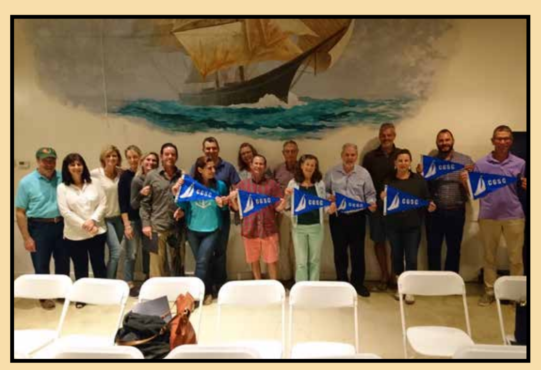
These are the new members who received their burgees at the January General Meeting.

SEE NOTICES OF RACE AND REGISTRATION FORMS @ WWW.CGSC.ORG FOR BBYRA 2018-19 SAILING INSTRUCTIONS VISIT THEIR WEBSITE @ WWW.BBYRA.NET