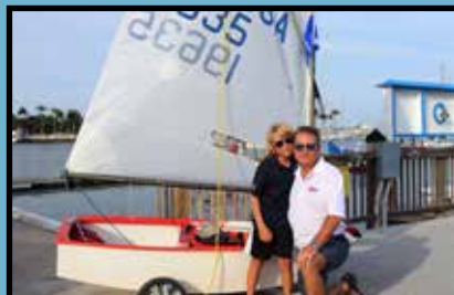
There were presentations, installations and lots of great food enjoyed by all.