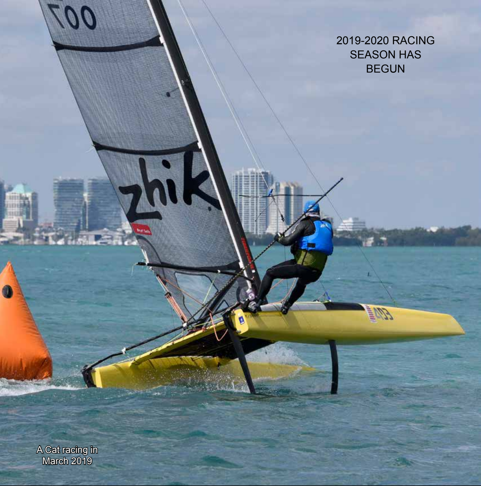
A Cat racing in March 2019