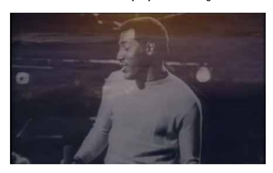
"Dock of the Bay" by Otis Redding