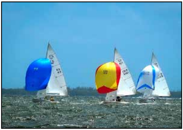
continued on pg 6