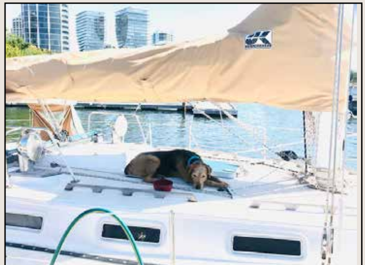
Just hanging out on the bay.