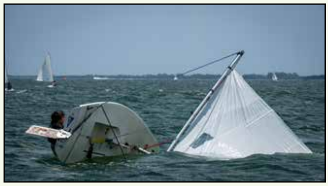
ontinued on 6