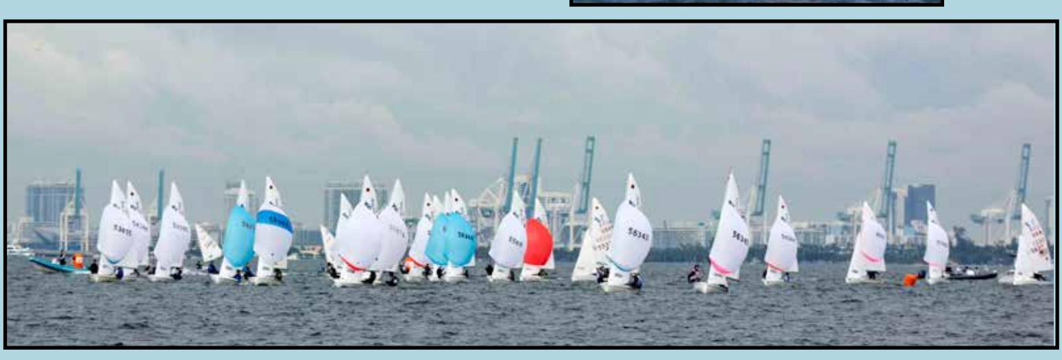
continued on 6