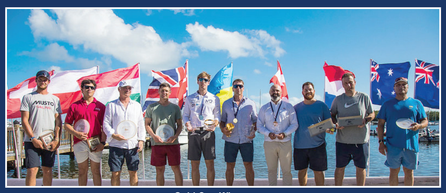
Gold Cup Winners