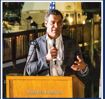
Mayor Suarez welcomes the competitors to Miami.