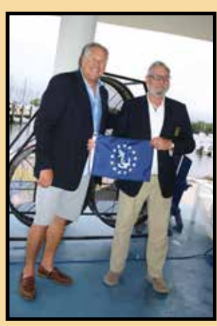
Cocktail Time and Changing of the Guard