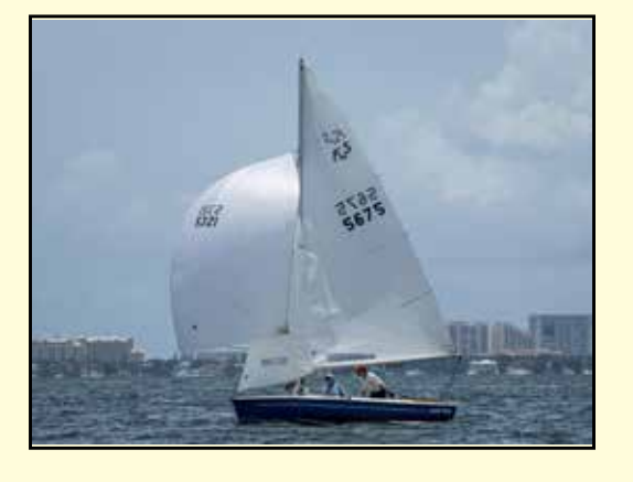
Sunday, June 25