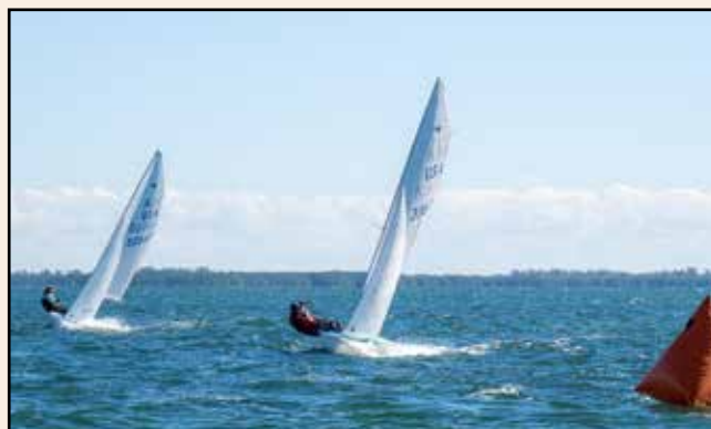
CGSC Stock photos from previous regattas.