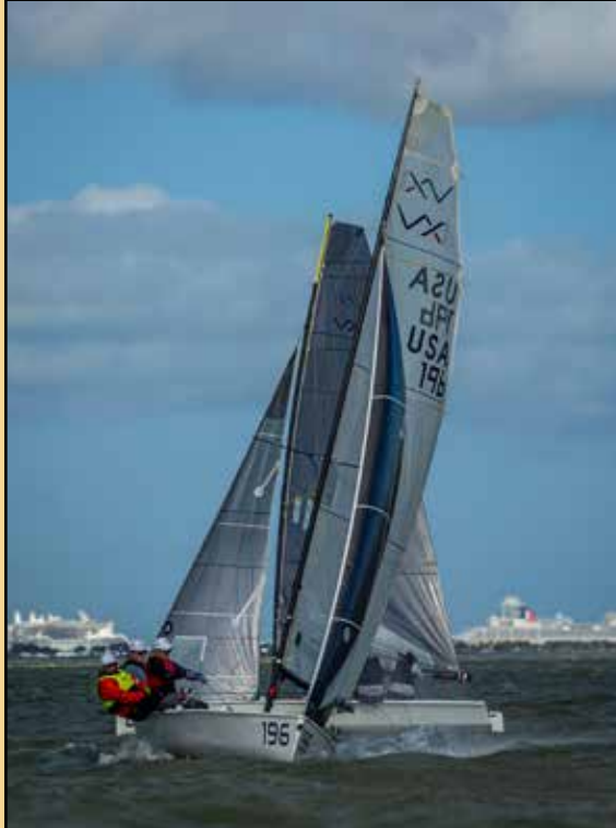
VX1